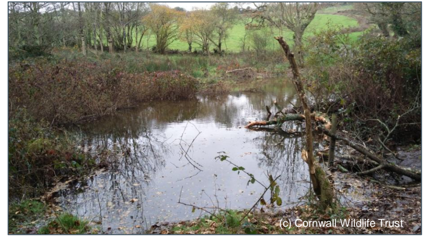
Two months later