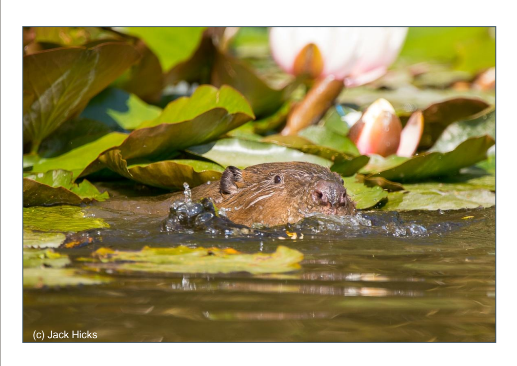
Natural catchment engineering