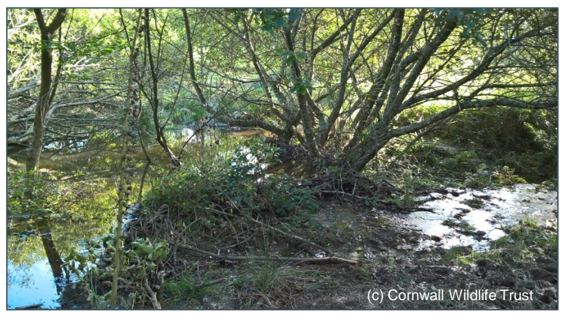
Early pond development