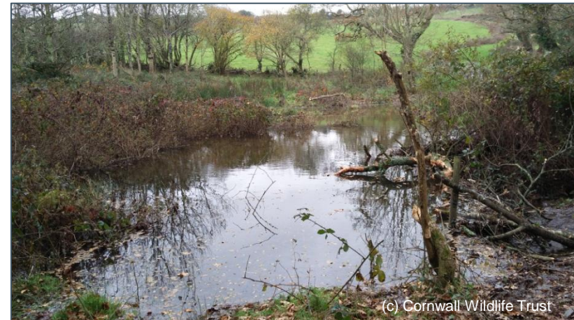
Two months later