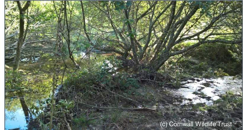
Early pond development